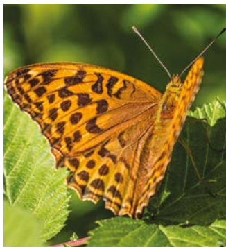
Silver-washed Fritillary