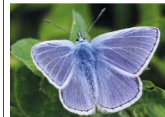
Common Blue