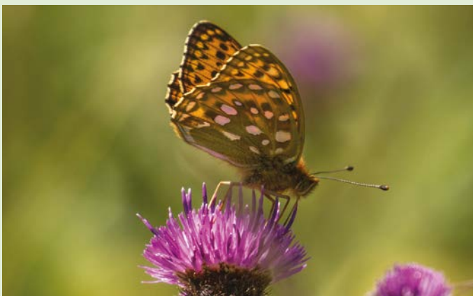
Dark Green Fritillary