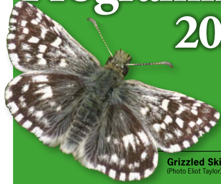
Grizzled Skipper

These field trips are a great way to learn about butterflies and their habitat, there will be help with identification available and there will also be photographic opportunities. Walks are open to anyone to attend. Please check weather conditions and come suitably prepared.