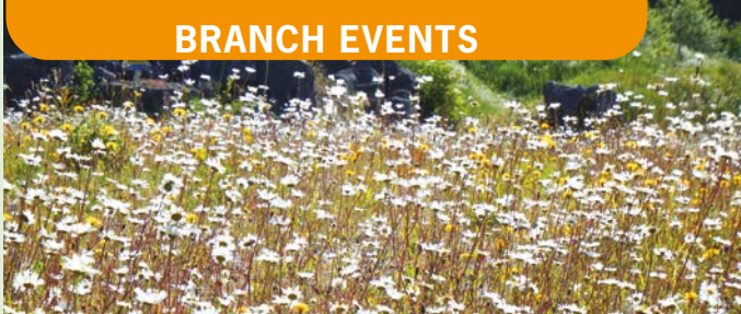
Hoe Grange Quarry