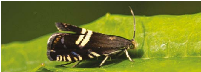
Liquorice Piercer moth