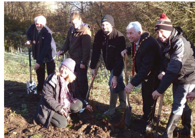
Team effort - the first sallows are planted

"In order to help the butterfly to get established in South Derbyshire, EMBC formed the joint venture with SDDC, together with a number of other organisations and landowners to plant Willows – the larval food plant for their caterpillars – along woodland sites in South Derbyshire. By carrying out this conservation work we are extremely hopeful that 'His imperial Majesty' will grace our woodlands for the first time very soon!"