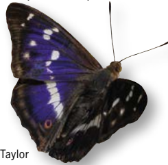
Eliot Taylor Purple Emperor. Photo: Eliot Taylor