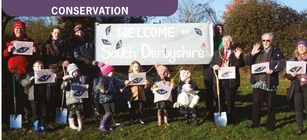
Rosliston Primary Schoolchildren show off their Majestic craftwork