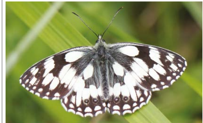
Marbled White