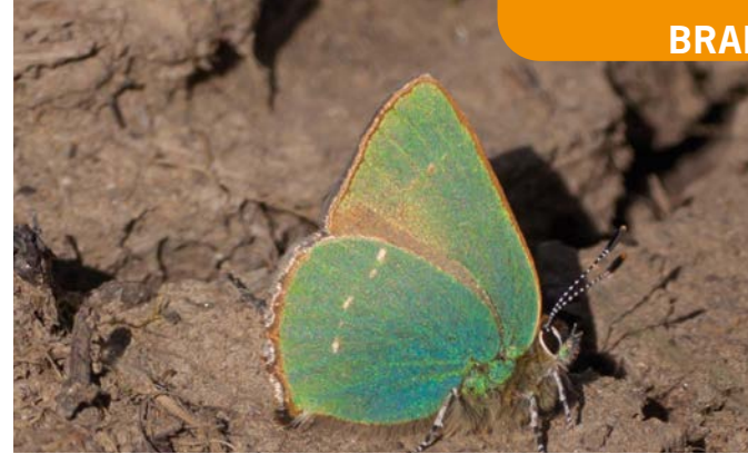
Green Hairstreak

Target Species: Dingy & Grizzled Skippers, Green Hairstreak, Liquorice-piercer and Orange-tailed Clearwing moths.